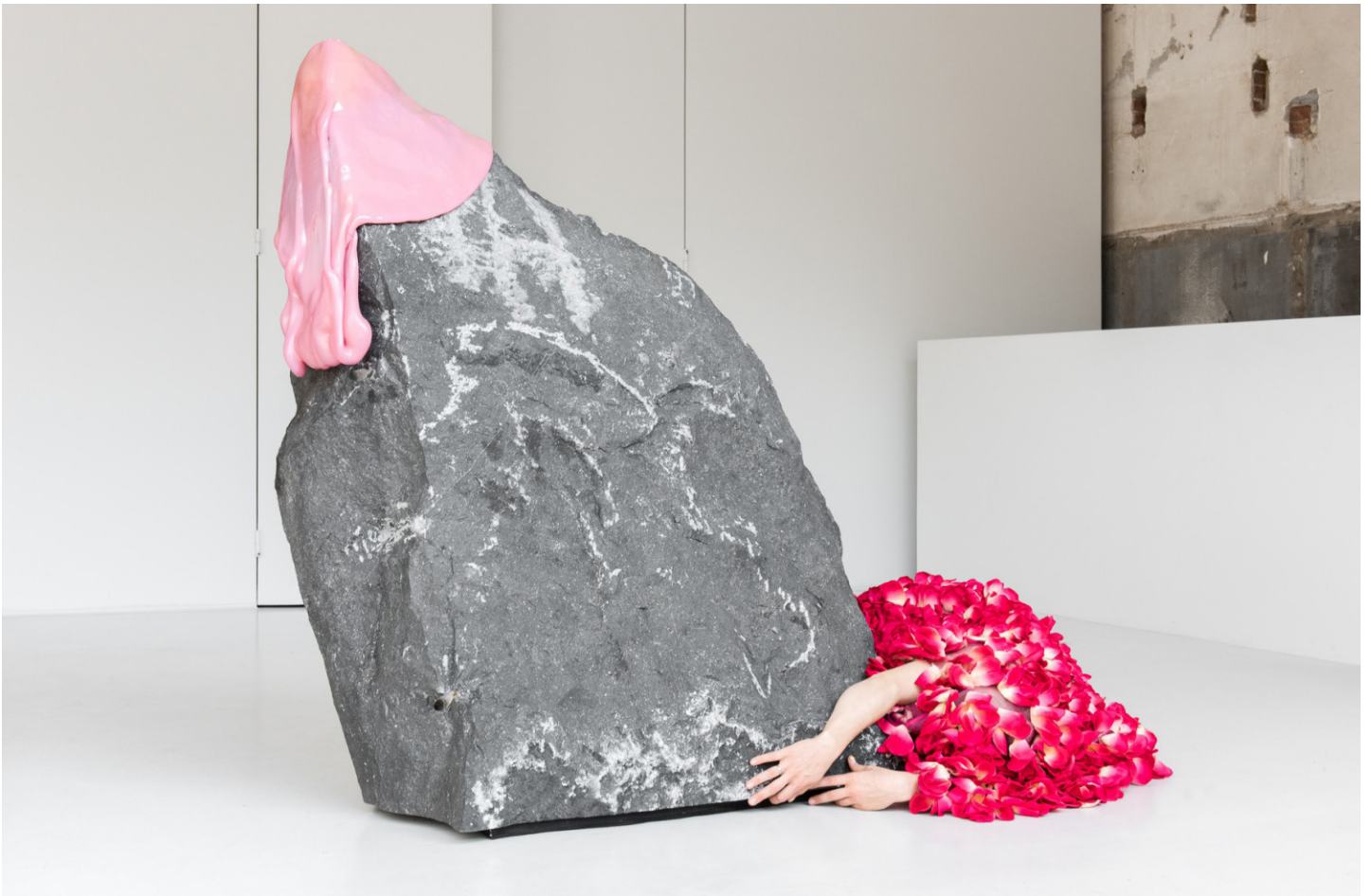
previous work of artist carly rose bedford at project space looiersgracht