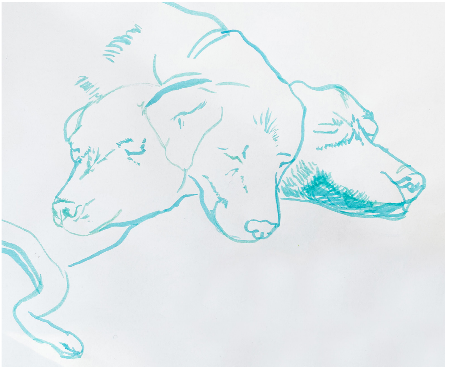
sketch for glass sculpture charon

for more information visit www.theo.vandoesburgstichting.nl