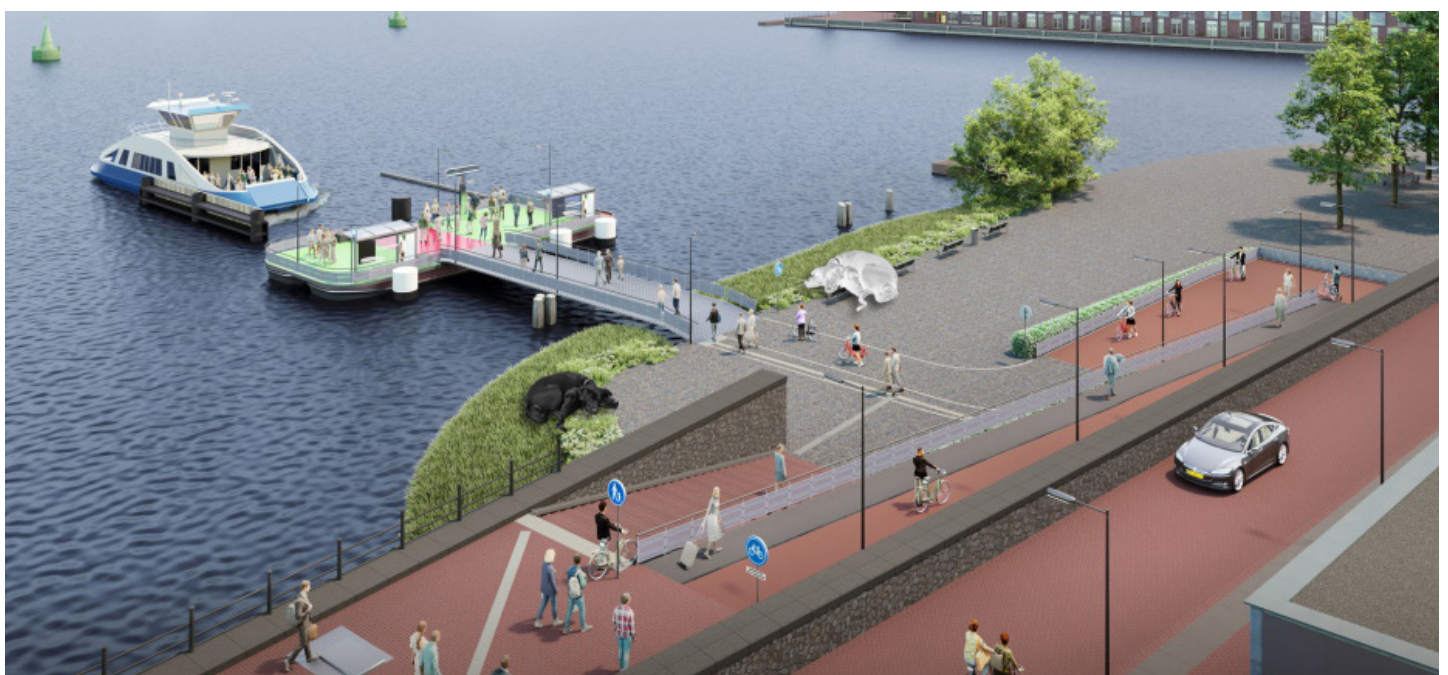
illustration of glass sculpture at ferry dock sluisbuurt

looking at a cross-section that shows a topography of hydrogeological history each layer can be referred to as an archive, like the pages of a book, detailing the ecology