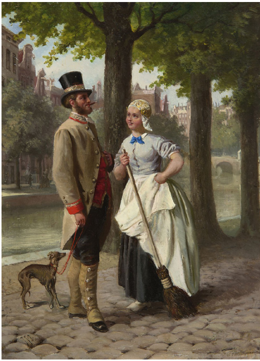
jan jacobo zuidema broos (1833–1882) "romance along the canal, amsterdam", oil on panel 29 × 21 cm, signed lower left. collection simonis _ louunk, the netherlands

and river that once flowed there. in mid-2023 more deep drilling will occur as part of the development for sluisbuurt, it will pass through two of these layers (bodies of water and sand) one at 20 meters dating from approximately 120 000 years ago, the other at 70 meters dating from around 238 000 years ago.