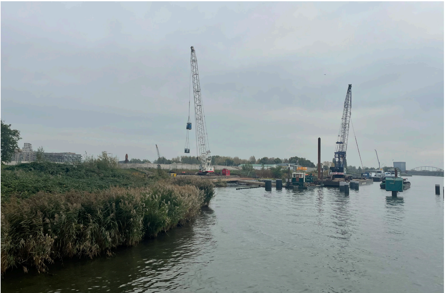
sluisbuurt dike location visit